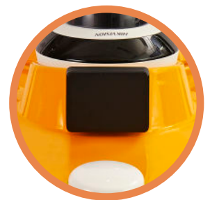
Millimeter Wave Radar