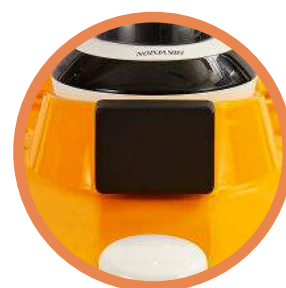
Millimeter Wave Radar