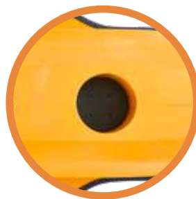
ADCP access shaft