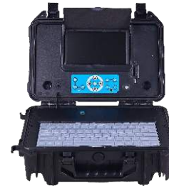
1 × Control Box