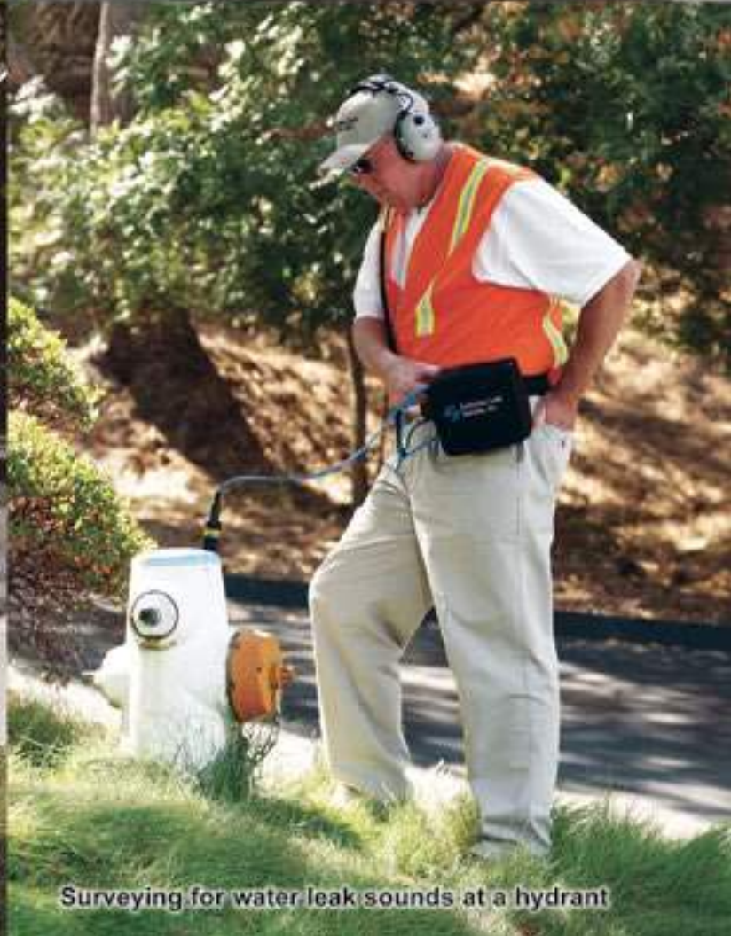
Surveying for water leak sounds at a hydrant