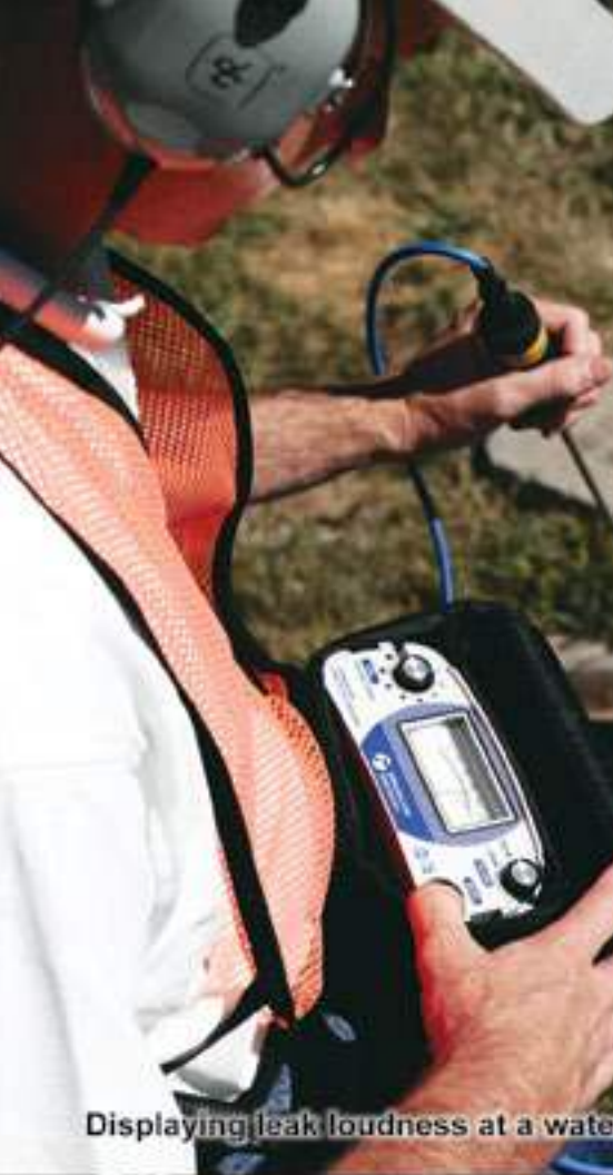
Displaying leak loudness at a water meter

855-422-6346 toll free www.ssilocators.com