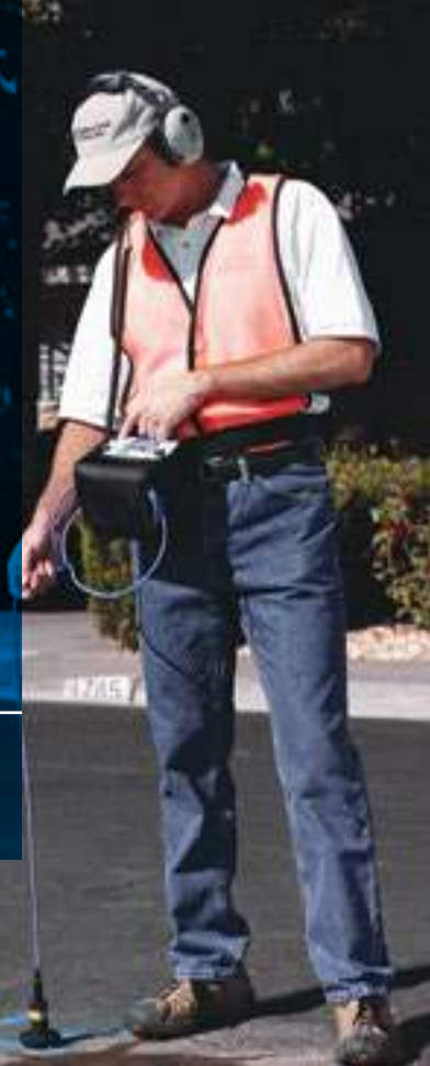
Pinpointing a water leak directly over the pipe