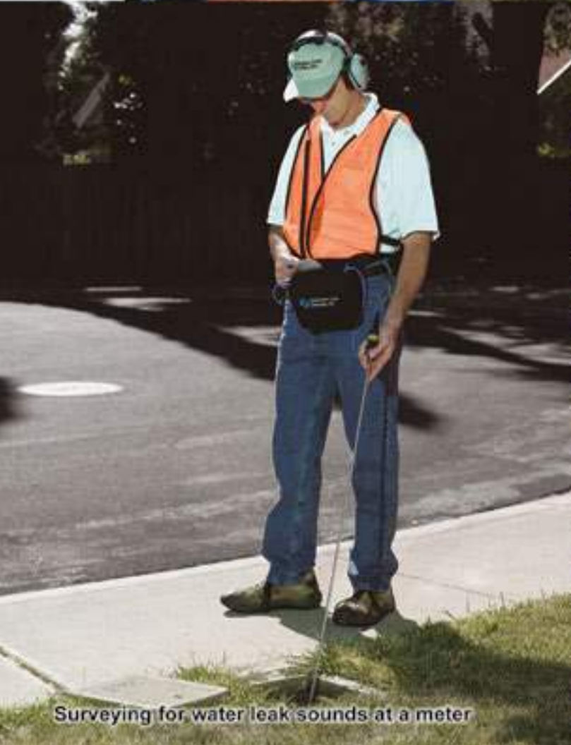
Surveying for water leak sounds at a meter